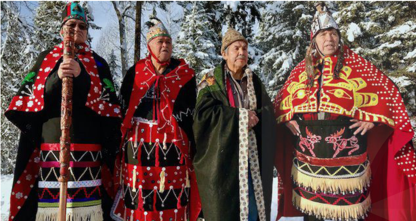
Credit: Wet'suwet'en hereditary chiefs.

The following tool was developed for the Stronger Together: A Toolkit for First Nations-Municipal Community Economic Development 8 to guide civic and Indigenous leaders and practitioners in understanding key features of, and differences between First Nations and municipal governance and legislation systems. and how they contrast listing the services commonly provided by each type of community. (See tables on pages 101 and 102)